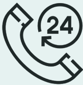
In-House Communications Center